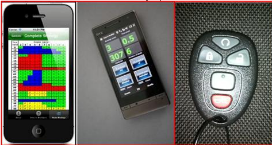
Cell phone applications for card counting and basic strategy...Card Count Key Fob

Another reality which needs to be accepted by the gaming industry is that even though cheaters technology has evolved dramatically from the bulky full body worn cameras and devices...Simple Game Protection has not. Whether the Plus/Minus Card Count is gained with simple math skills in your head or with a Smartwatch, the play will look like Card Counting.