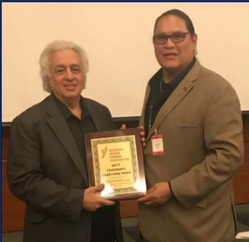
NIGA - Chairman's Leadership Award

Secrets of Las Vegas - MSNBC Primetime LV Codes & Conspiracies - America's Most Wanted History of Las Vegas - Criss Angel Mind Freak Cracking the Con - "All In" The Poker Movie Inside Las Vegas - Dateline NBC - Cheating LV